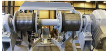
Cable Spools and Cables Two (2) special grooved spools prevent cable climbing and flattening Two (2) heavy duty steel cables for even lifting with eccentric loads