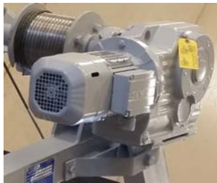
Drive Machinery Direct drive gearbox connected to head shaft TEFC 230/460 volt, 3 phase, 60 hertz motor Approximately 30 feet per minute travel speed