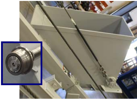
Bucket Assembly Heavy duty steel bucket Steel rollers with graphite bearings never leave track