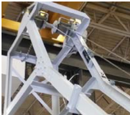
Frame and Track Assembly Heavy duty all welded construction 65° incline Extra heavy structural steel channel Manufactured to fit plant needs