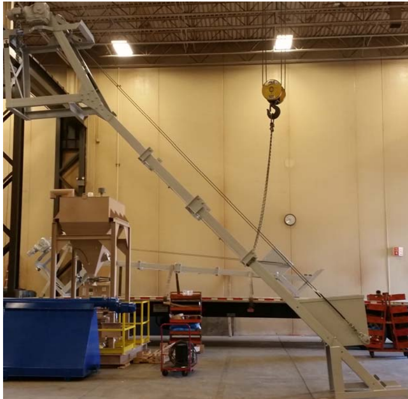
65° SKIP HOIST SHOWN - OTHER HOIST TYPES AND OPTIONS ARE AVAILABLE - CONSULT FACTORY