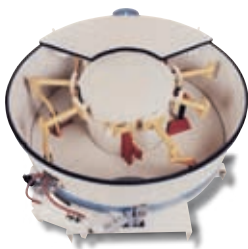
Rotating case and mixing paddles