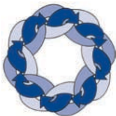
Superior braiding action of Turbin design (top view)