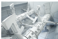
Round shaft to reduce concrete build-up, and bolt-on Ni-hard wear parts.