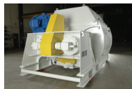
Easy access for all the drive components.

Introducing our new U.S.-built twin shaft mixer. It's manufactured from proven American components for easy maintenance. It includes class-leading features like air purge seals to prevent concrete leakage, and a drive package that can be removed as a single unit. And it's equipped with cast Ni-hard liners and paddles for a long life. Find out more about the first twin shaft mixer so durable, it may be the last one you'll ever need.