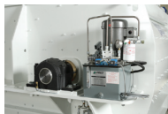
Hydraulic pump with manual override in case of power loss.